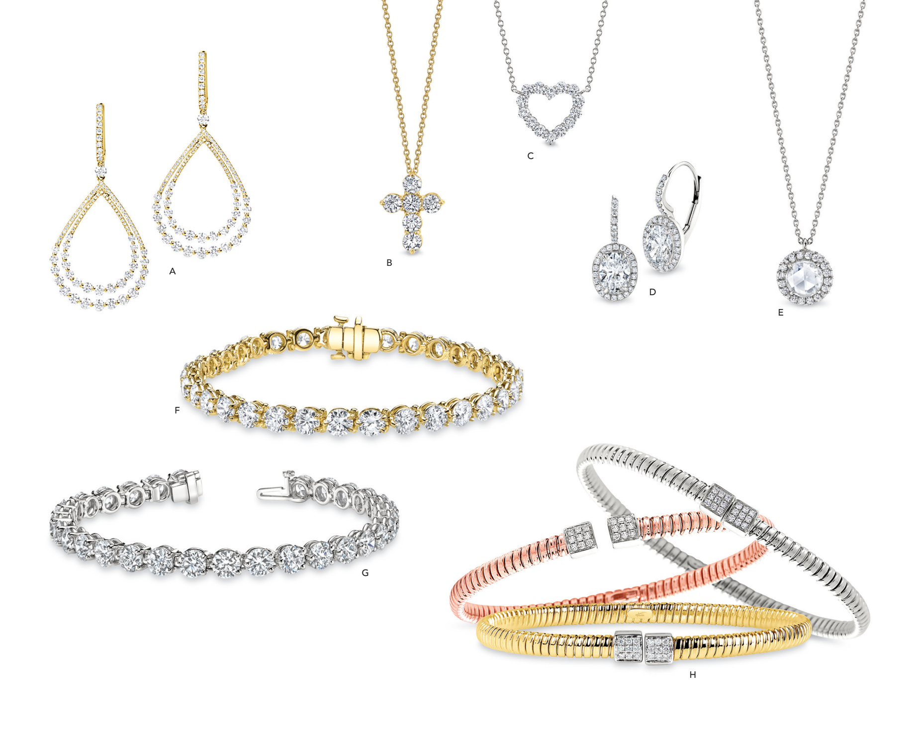
A. Pear drop diamond earrings, $6,550 B. Diamond 6 stone cross pendant in 18kt yellow gold, $9,350 C. Diamond straight heart pendant in 18kt white gold, $6,100 D. Diamond micro halo drop earrings in platinum, $11,550 E. Rose cut diamond micro infinity halo pendant in platinum, $13,500 F. Diamond tennis bracelet, 8.00cttw in 14kt yellow gold, $17,850 G. Diamond tennis bracelet, 10.17cttw in 14kt white gold, $21,800 H. Italian Tubogas diamond bangles, $2,500 ea.