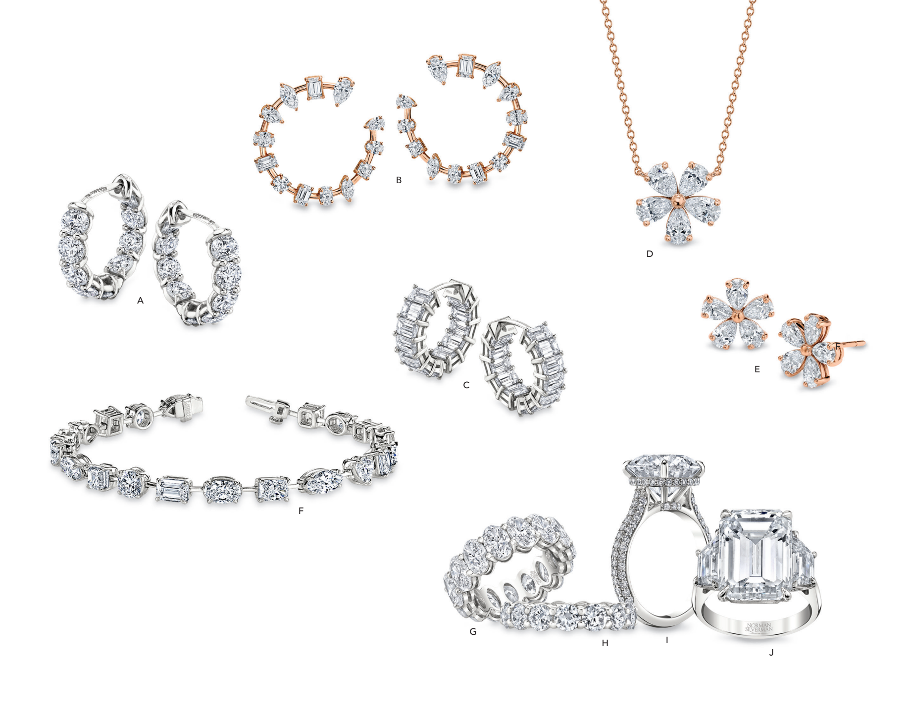
A. Round diamond huggie hoop earrings, 2.65cttw, $8,000 B. Open face fancy shape diamond hoop earrings in 18kt pink gold, 4.13cttw, $19,000 C. Emerald cut diamond huggie hoop earrings, 4.47cttw, $16,000 D. Diamond flower pendant, 2.00cttw in 18kt pink gold, please call for price E. Diamond flower earrings, 2.00cttw in 18kt pink gold, $72,000 F. Fancy shape diamond bracelet, 10.19cttw, $72,000 G. Oval diamond eternity band, 9.12cttw, $74,000 H. Round diamond eternity band, 4.68cttw, $25,000 I. Round diamond ring in a 3 sided platinum shank with pavé, 5.02cttw, $330,000 J Three stone emerald cut diamond ring in platinum, 11.03cttw, $411,155