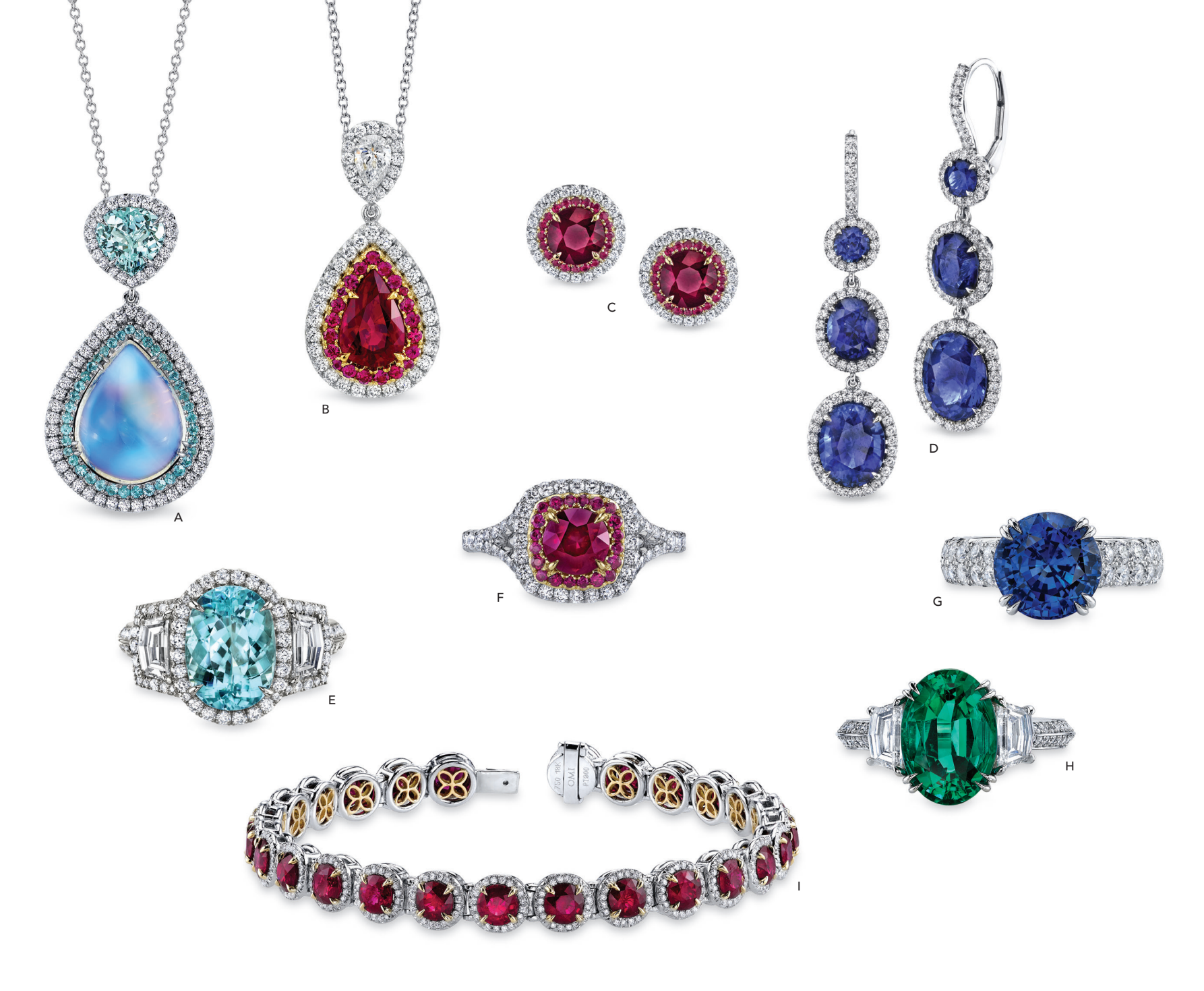
A. Moonstone, Paraíba tourmaline and diamond pendant in platinum, $46,000 B. Ruby and diamond pendant in platinum and 18kt yellow gold, $27,000 C. Ruby and diamond stud earrings in platinum and 18kt yellow gold, $13,400 D. Sapphire and diamond earrings in platinum, $80,000 E. Paraíba-type tourmaline and diamond 3-stone ring in platinum, $64,000 F. Ruby and diamond ring in platinum and 18kt yellow gold, $18,400 G. Sapphire and diamond ring in platinum, $58,000 H. Emerald and diamond 3-stone ring in platinum, $100,000 I. Ruby and diamond bracelet in platinum and 18kt yellow gold, $64,000