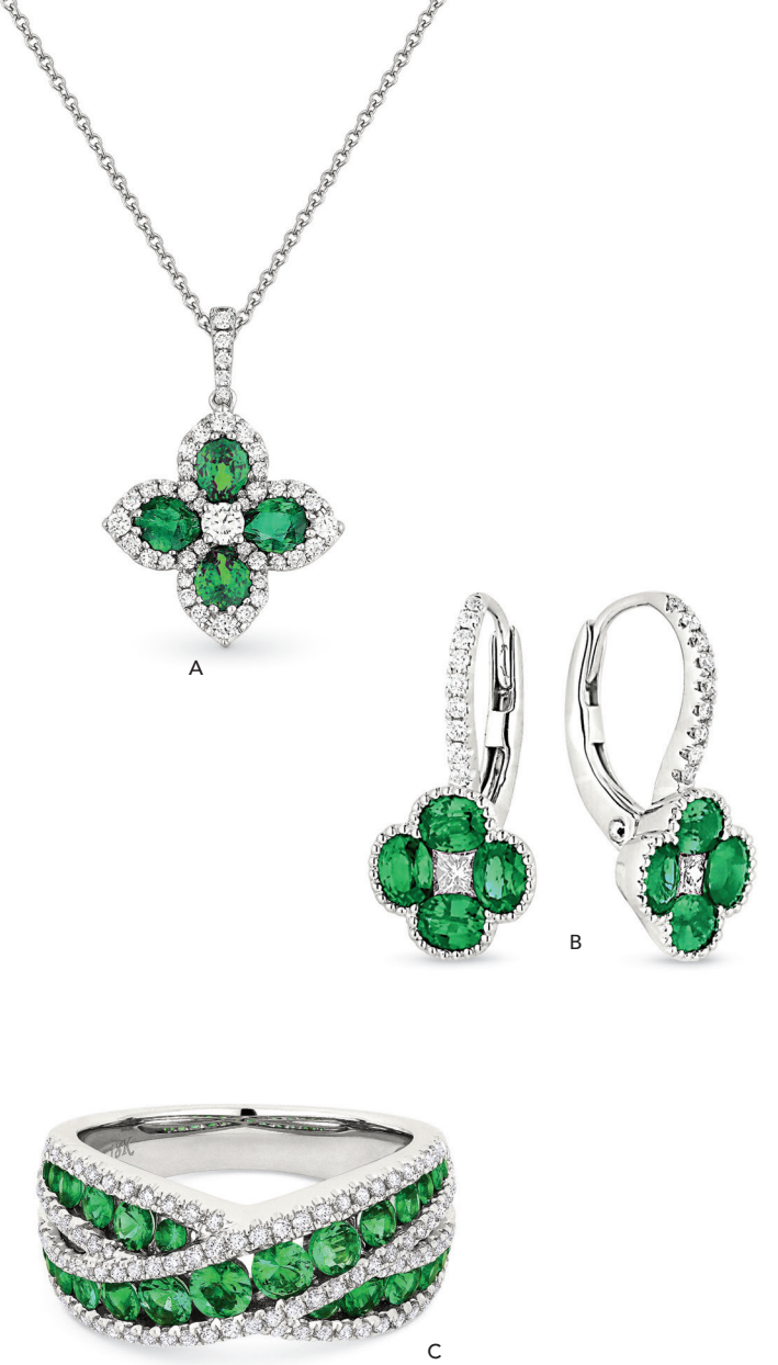
A. Emerald and diamond necklace in 18kt white gold, $5,425 B. Emerald and diamond leverback earrings in 18kt white gold, $4,700 C. Emerald and diamond cross over ring in 18kt white gold, $4,850 MODEL ITEMS: Earrings – Emerald and diamond custom earrings with two dangling oval emeralds set in a diamond halo in 18kt white gold, $7,950 Necklace – Emerald and diamond necklace with two dangling fine oval columbian emeralds set in a diamond halo in 18kt white gold, $32,850