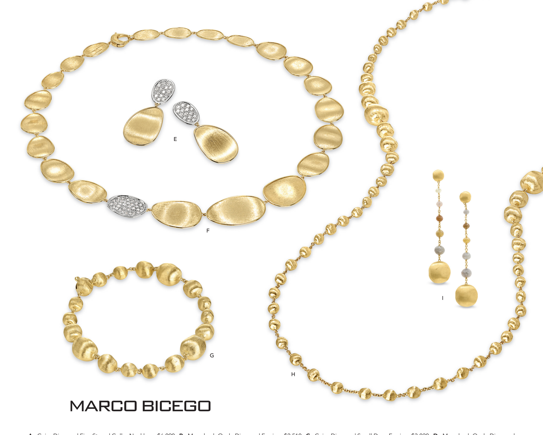
A. Cairo Diamond Five Strand Collar Necklace, $6,090 B. Marrakech Onde Diamond Earring, $2,510 C. Cairo Diamond Small Drop Earring, $3,020 D. Marrakech Onde Diamond Flat Link Bracelet, $2,600 E. Siviglia Grande Diamond Large Drop Earring, $3,810 F. Lunaria Single Diamond Station Necklace, $7,450 G. Africa Mixed Bead Medium Bracelet, $2,300 H. Africa Graduated Double Wave Necklace, $7,930 I. Africa Mixed Gemstone Duster Earring, $2,830 MODEL ITEMS: Long necklace – Gold and Black Diamond Necklace, $9,800 Short necklace – Gold and Black Diamond Necklace, $9,130 Earrings – Gold and Black Diamond Earrings, $4,840 All items are crafted in 18kt gold.