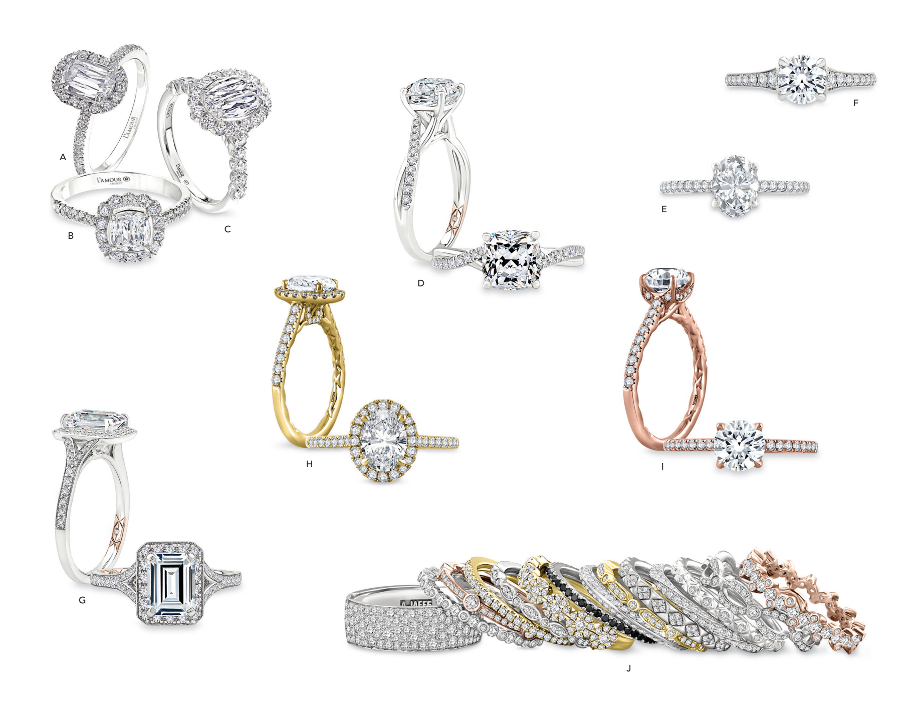
A. Engagement ring with a 1.25ct diamond center, $11,750 B. Engagement ring with a 0.40ct cushion diamond center, $4,650 C. Engagement ring with a 1.00ct oval diamond center, $11,850 D. Crossover style with side diamonds, $2,190 E. Oval Engagement Setting, Starting at $1,460 F. Pavé Diamond Round Engagement Setting, Starting at $1,620 G. Halo ring for emerald cut center, $2,190 H. Oval Halo Engagement Setting, Starting at $1,940 I. Round Solitaire Engagement Setting, Starting at $1,580 J. Diamond Stackable Rings, Starting at $520