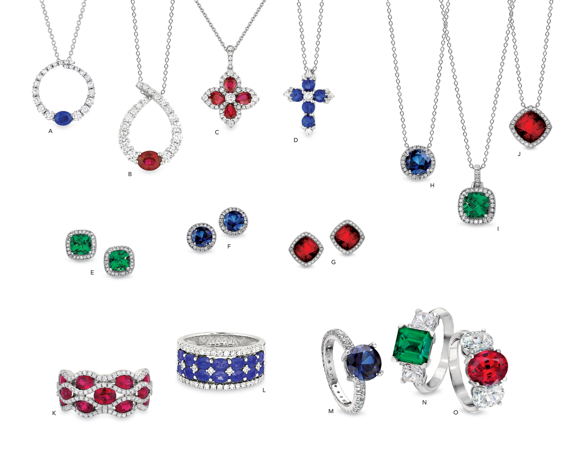
A. Oval sapphire and diamond pendant in 14kt white gold, $1,480 B. Oval Ruby and diamond pendant in 14kt white gold, $2,580 C. Ruby and diamond pendant in 14kt white gold, $4,250 D. Blue sapphire and diamond cross pendant in 14kt white gold, $905 E. – G. Earrings available in different price points H. – J. Necklaces available in different price points K. Ruby and diamond band in 18kt white gold, $5,950 L. Blue sapphire and diamond band in 14kt white gold, $4,150 M. 2ct sapphire ring with diamonds in 18kt white gold, $6,850 N. 3ct emerald ring with diamonds in 18kt white gold, $36,500 O. 2ct ruby ring with diamonds in 18kt white gold, $20,190